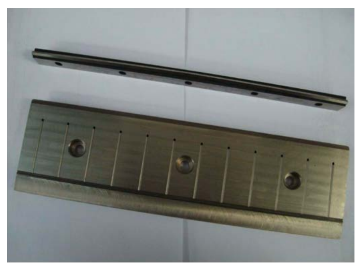
Upper and lower knife