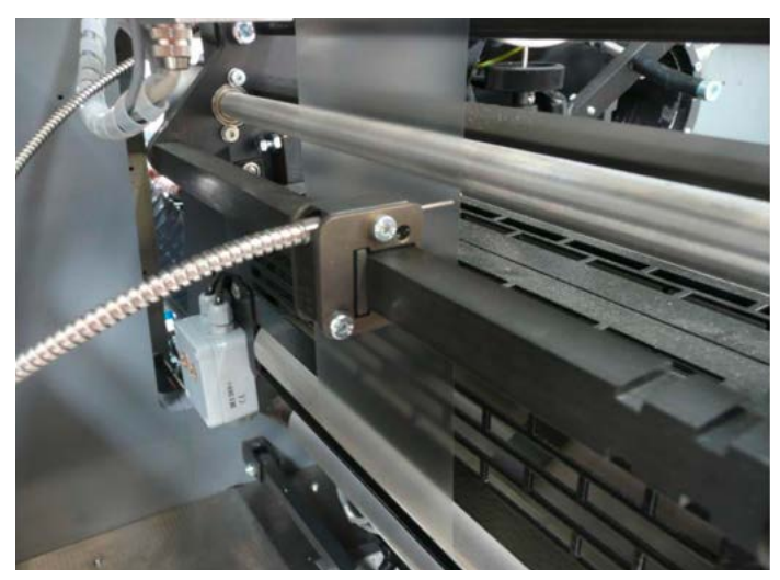
Register mark scanner