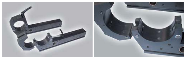
Printing Unit Tetraflex and Tetraflex Plus

Reinstatement of original value, fast and easy with minimal work and effort!