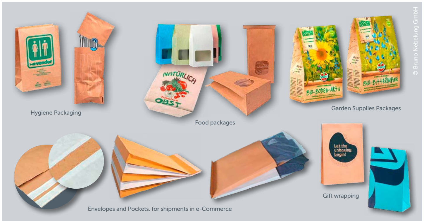
Examples of packaging common to the industry