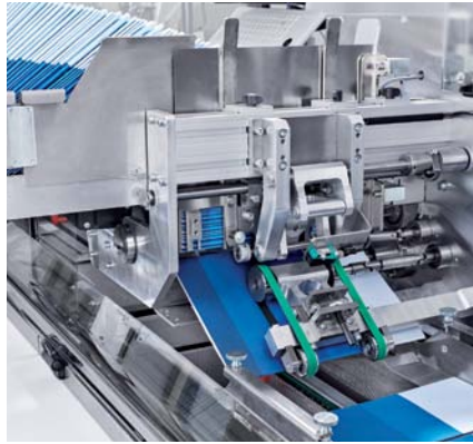
Catalog feeder CF2